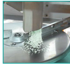
Kontrolisano sipanje đubriva na disk Controlled descent of fertilizer onto spreading disc