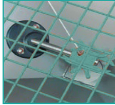
Standardna mreža za filtriranje sa rotirajućim mešačem Standard filtering grids with an ultra-slow rotating agitator