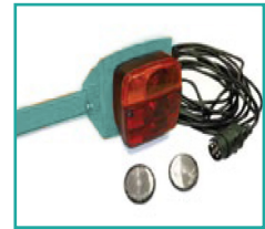
Zadnja svjetla Tail lights