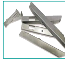
Lopalice za rasipanje do 36m Vanes for spreading up to 36m