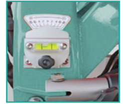
Regulator za kasnije rasipanje Tilt regulator for late spreading