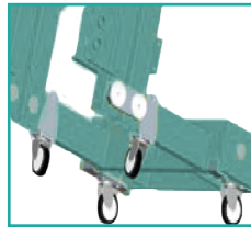
Kolica za parkiranje Parking wheels