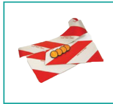
Oprema za sigurnost na putu Road safety equipment