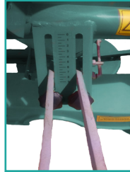
Kontrola toka Flow control