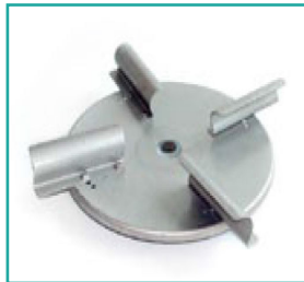
Disk od nerđajućeg čelika Stainless steel spreading disc