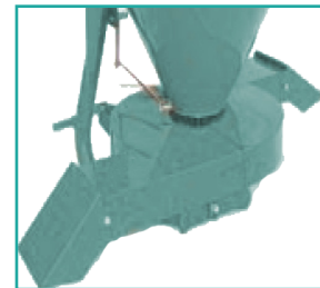
Dupli konvejer đubriva Dual fertilizer conveyor