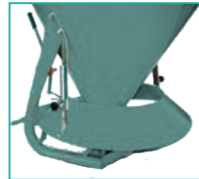
Deflektor za so/pesak Deflector for salt/sand