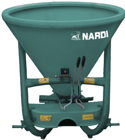
SP model sa plastičnim rezervoarom SP model with plastic tank