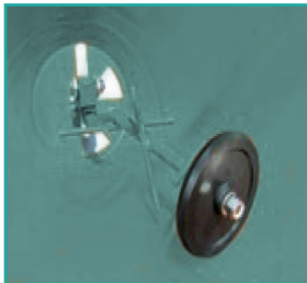
Artikulisani mešač Articulated agitator