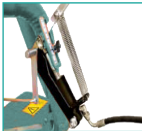
Uljani hidraulični pogon Oil hydraulic drive