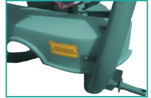
Kačenje u tri tačke Three-point coupling