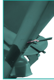
Rotacioni disk Rotation disc