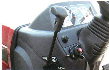
F&R Synchro Shuttle Lever