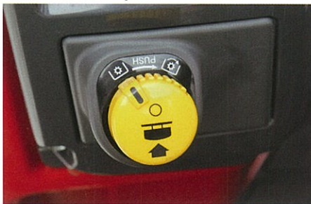
One Touch Independent PTO Clutch