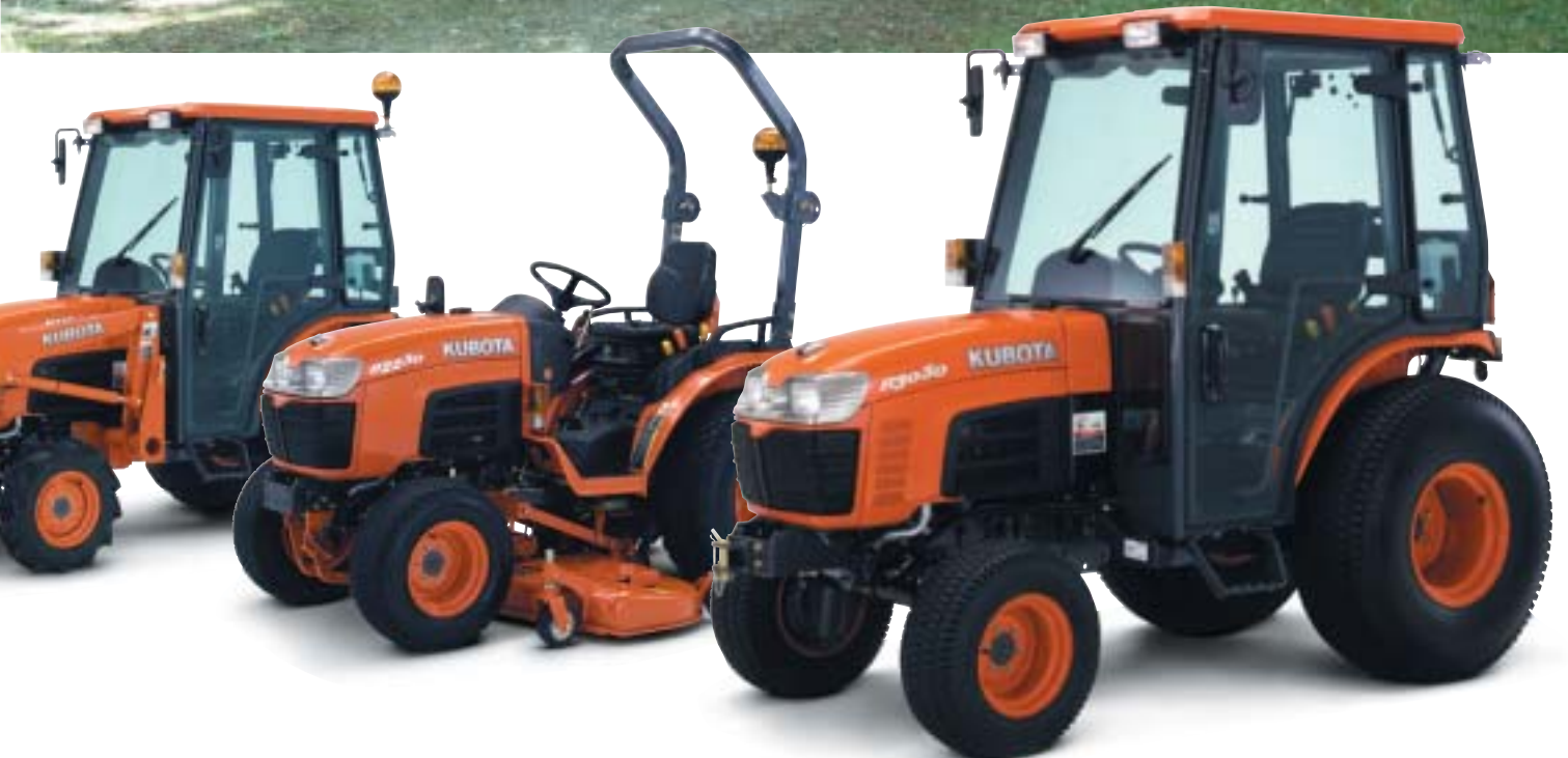
THE NEW PREMIUM SUPER B-SERIES DIESEL TRACTOR B1830/B2230/B2530/B3030