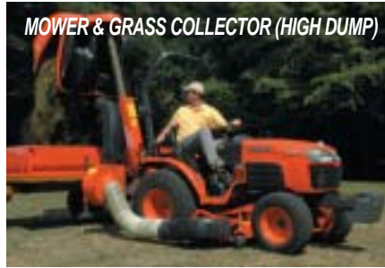
MOWER & GRASS COLLECTOR (HIGH DUMP)