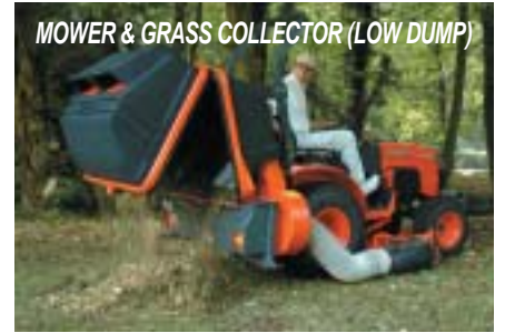
MOWER & GRASS COLLECTOR (LOW DUMP)