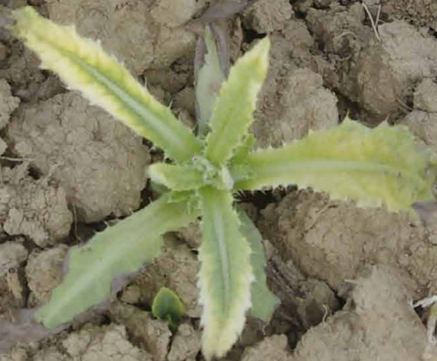
Osjak ( Cirsium arvense )