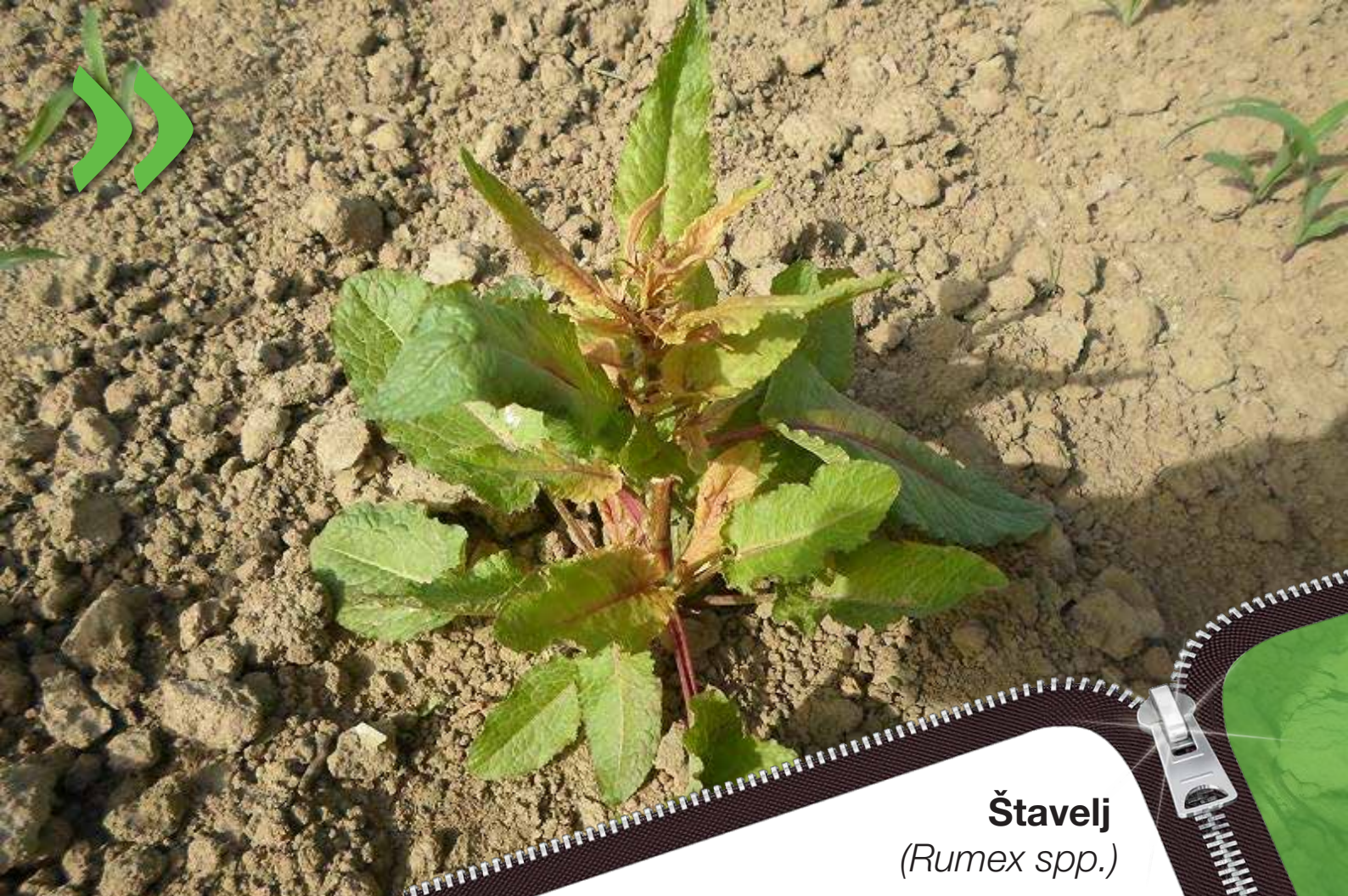
Štavelj ( Rumex spp. )