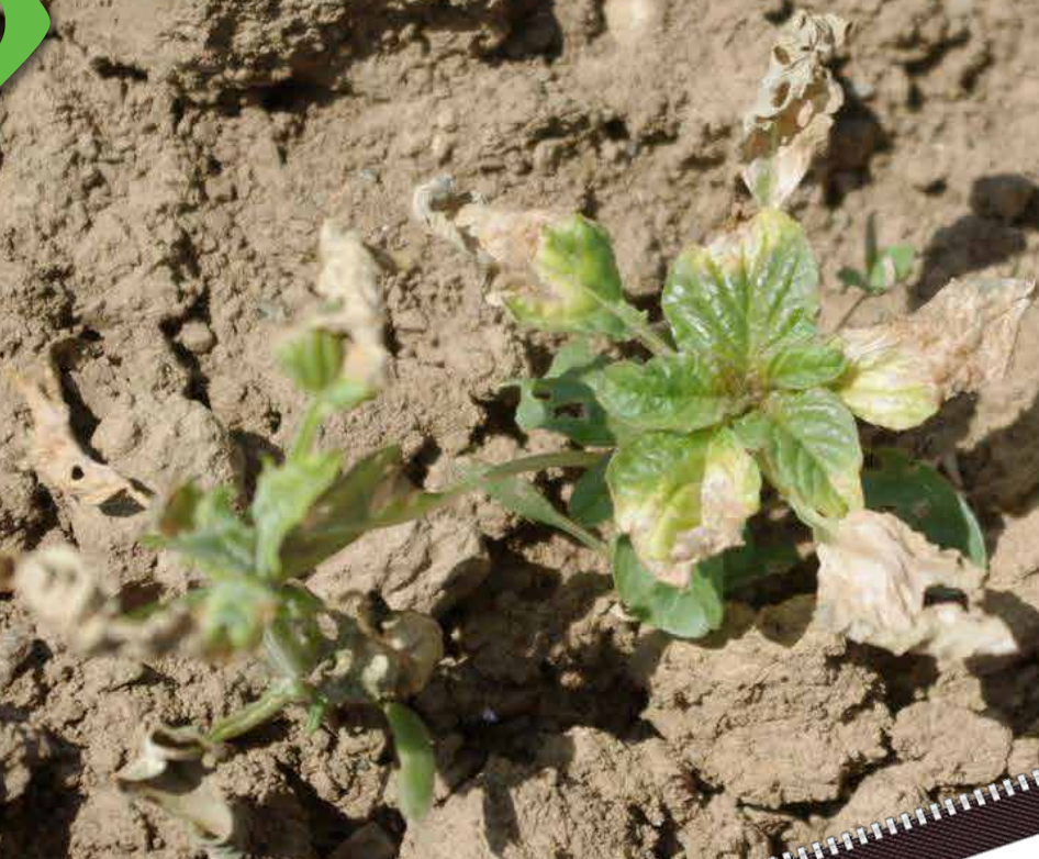
Štir ( Amaranthus spp. )