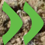
Loboda ( Chenopodium spp.)