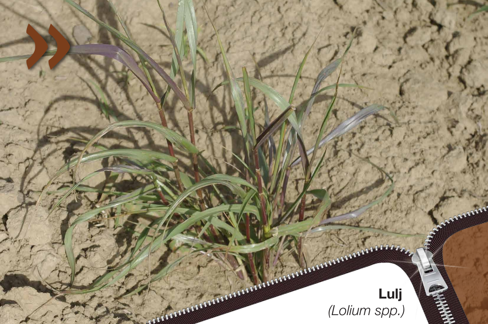
Lulj ( Lolium spp.)