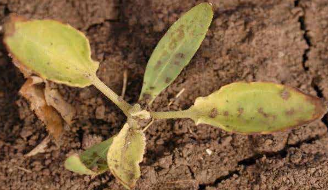
Čičak ( Xanthium strumarium )