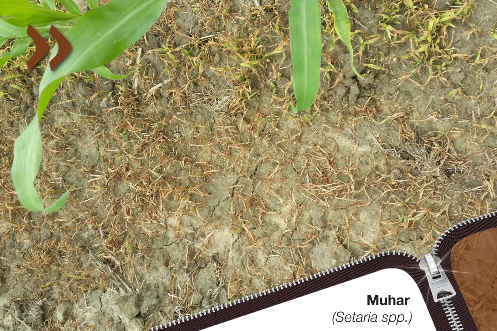
Muhar ( Setaria spp.)