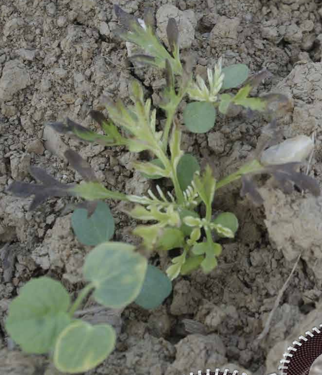
Ambrozija ( Ambrosia artemisiifolia )