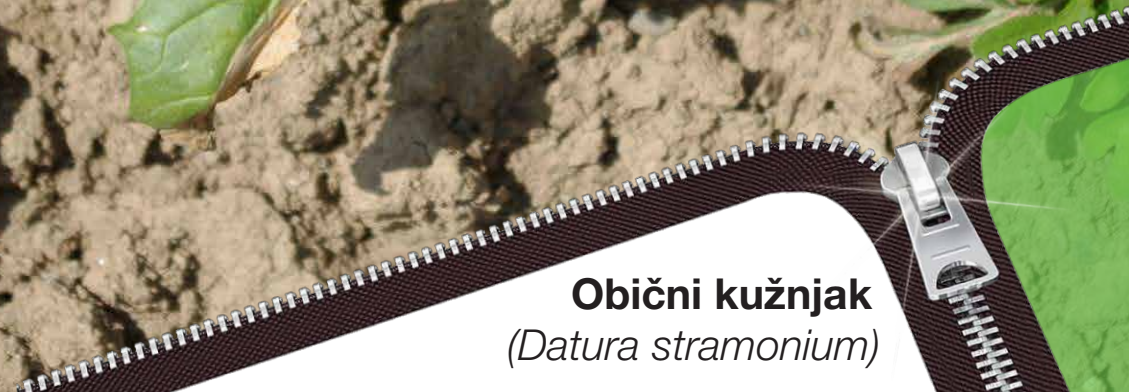
Obični kužnjak ( Datura stramonium )