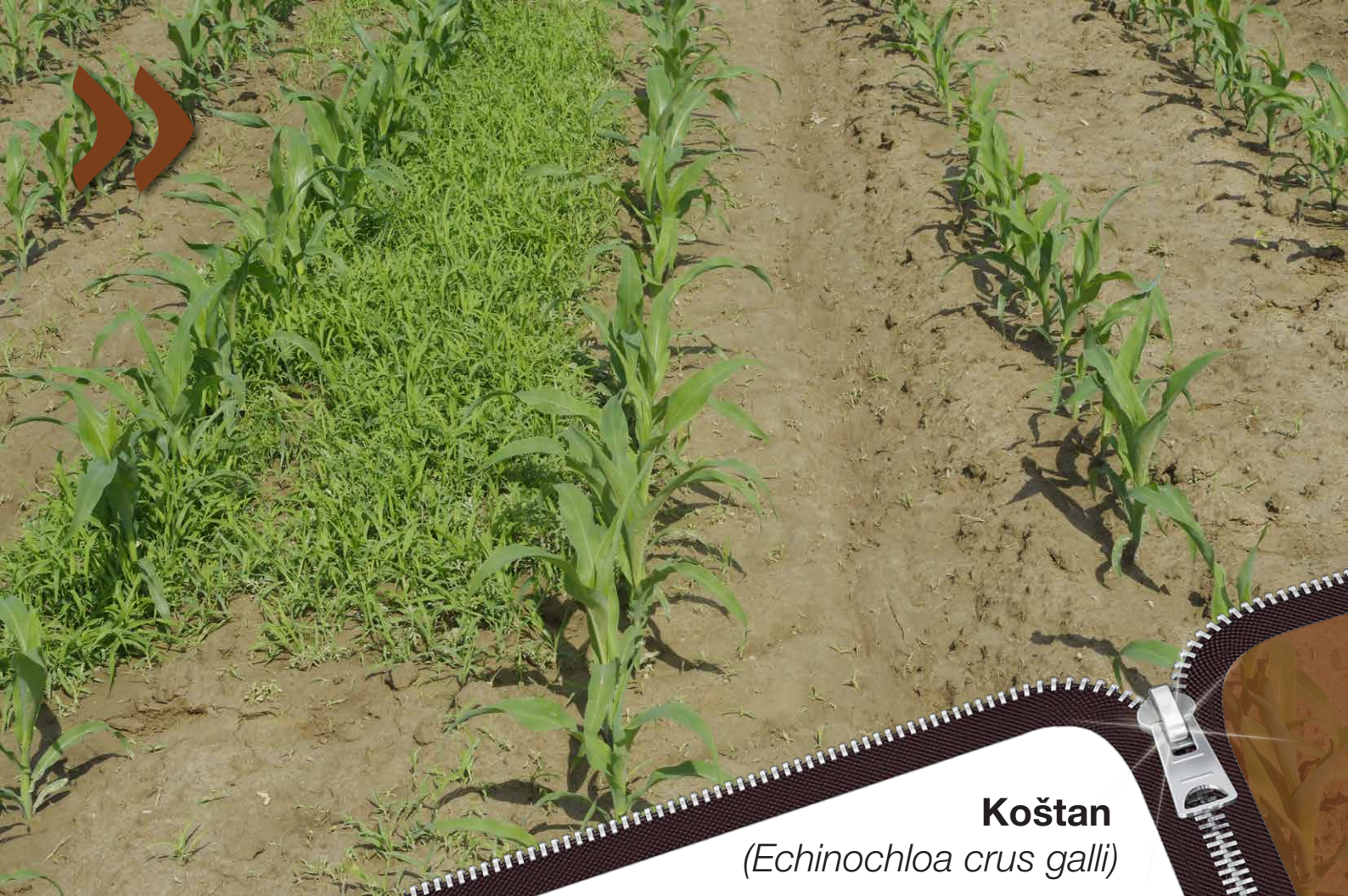
Koštan ( Echinochloa crus galli )